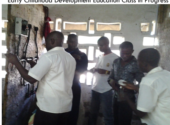
Electrical students in a Wiring Practical session