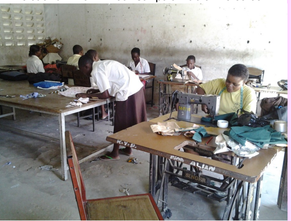
Students in Tailoring Department on Training practice