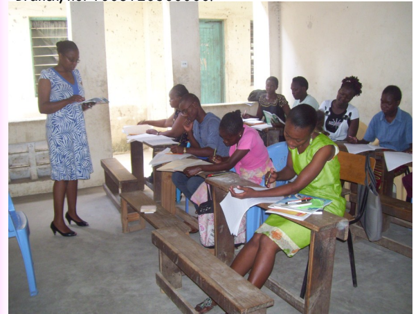
Early Childhood Development Education Class in Progress

Fees are paid through the following account numbers: Bank-Kenya Commercial Bank, Treasury Squire Branch no: 1107605652 or Consolidated Bank; Nkrumah Road Branch, no: 10081203000007