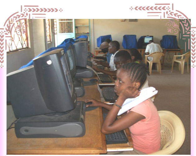
Students in the Hi- Tech Computer Lab of the School